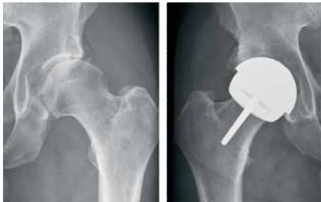
(R) Xray of hip with TJR

In general terms, a joint is the junction of two bones separated by cartilage and lubricating fluids, and held together with muscle and connective tissue. In damaged joints the bones can rub together, which may be very painful. Modern joint replacement replaces the damaged or worn cartilage (and sometimes some of the bone) with a metal, ceramic or plastic implant. The implant resembles and functions similarly to a